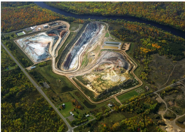
Flambeau Mine near Ladysmith, while operating

Wisconsin's Green Fire, along with nine other environmental groups, submitted comments to the Wisconsin Department of Natural Resources (WDNR), urging the Department to modify draft rules related to sulfide metallic mining ( See joint press release ). A 2017 bill passed by the state legislature made wholesale changes to mining laws and prompted