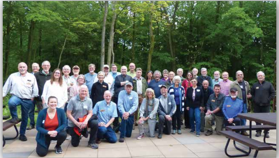
Caption: WGF's Science Council, Board, and Staff on retreat at Rib Mountain State Park, June 6, 2022

Advance science-informed analysis and policy solutions that address Wisconsin's greatest conservation challenges.