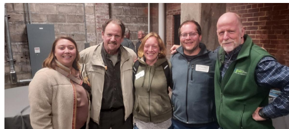
Photos: Athens Conservation Social at Stoney Acres Farm ; Eau Claire Conservation Social at The Brewery Projekt