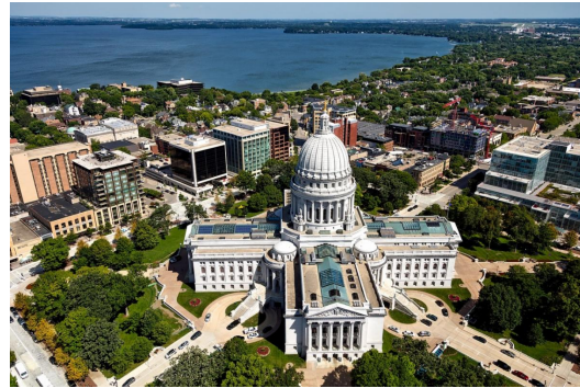
Capitol and downtown Madison

From PFAS to climate, agriculture, wake boats, and more, this update is one way we keep WGF members updated about the work ahead for this community of conservation experts.