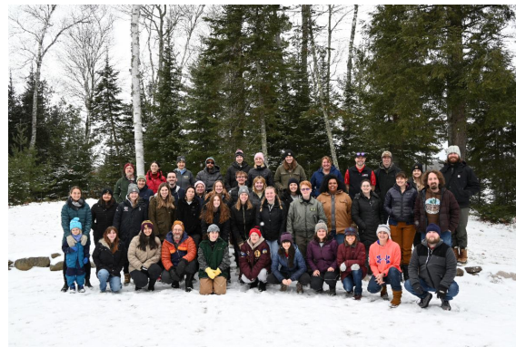
2nd Annual Conservation in Wisconsin Group Photo - January 3rd, 2024