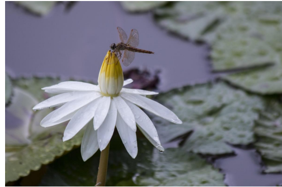
Photo: Dragonfly on lotus

In this blog post , we share two examples from our Board of Directors about the internal workings at WGF in addressing the federal changes.