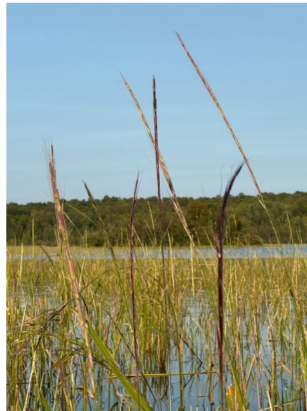
Ripening manoomin near Chippewa Lake, Bayfield County, 2024