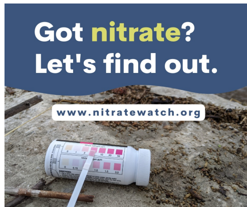
Wisconsin's Green Fire is now a Nitrate Watch partner with Izaak Walton League of America

Learn more and watch for more updates as our Nitrate Watch program grows.