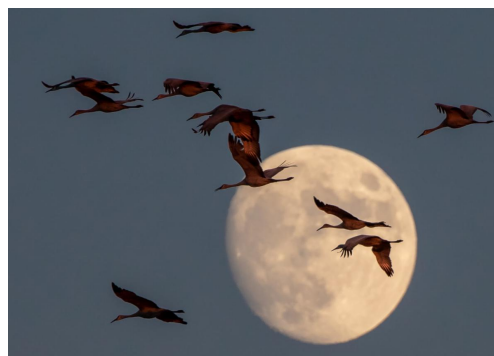
Photo: Sandhill cranes and moon

Have you been inspired by Wisconsin's landscapes, waters, flora, fauna, and fungi? We invite you to share your photos, poems, and other creative work with us to feature in our newsletters, website, and social media content. Review our submission guidelines here .