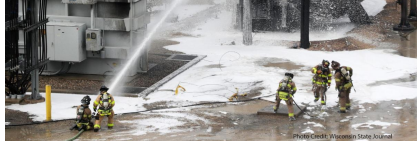
Photo: Aqueous film forming foam (AFFF) containing PFAS at use in a fire at a city of Madison electric substation in July, 2019.

Alongside members of the statewide coalition on PFAS, we signed a joint letter opposing the Department of Defense (DOD) provision that lifts an existing moratorium on the incineration of PFAS-containing firefighting foam and other PFAS-containing waste. This kind of incineration puts frontline communities, servicemembers, their families, and veterans who live downwind at risk.