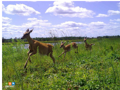
Photo: Doe and fawns

WGF supports the work and findings of the Legislative Audit Bureau's Report 25-15 from August 2025 which confirms that the Wisconsin Department of Natural Resources (WDNR) properly managed Fish and Wildlife Account funds. The bigger picture is the need for sustained longer-term funding for conservation.