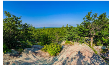
Photo: Hagar Mountain, Wisconsin State Natural Area #306, Chequamegon-Nicolet National Forest, July 2025.

We submitted comments to the US Dept. of Agriculture (USDA) under docket # FS-2025-0001. Our main points centered around wildfire risks, Tribal sovereignty, and economic and legal concerns.