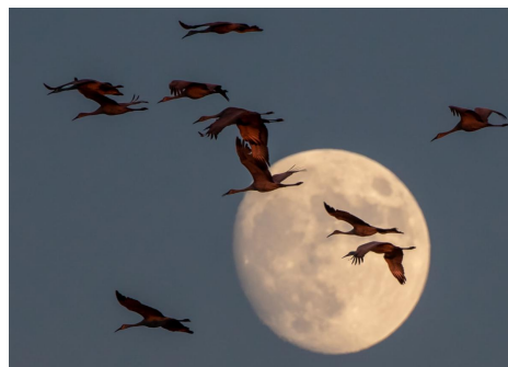
Photo: Sandhill cranes and moon.

We're especially looking for nighttime imagery and photos of the moon this fall! Review our submission guidelines here .