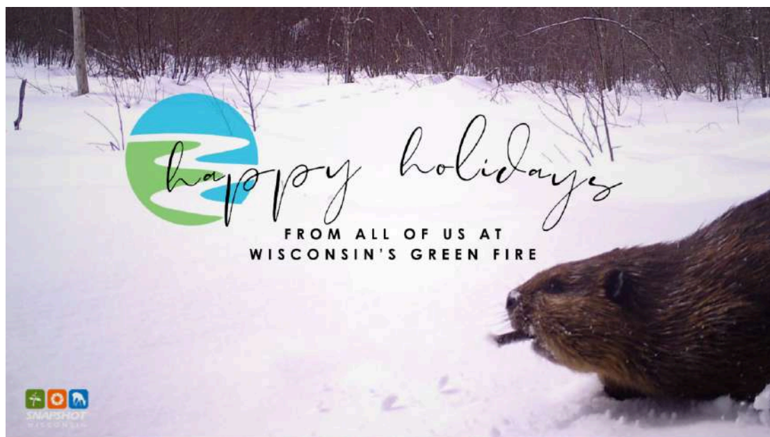
Image: Beaver in Florence County WI with text overlay: Happy holidays from all of us at Wisconsin's Green Fire.

policy. Their work helped us to do ours. This is a loss for all of Wisconsin, and a reminder to deepen our commitment to science-based policies for all Wisconsinites and beyond.