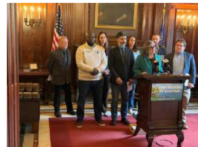
Photo: Clean Water for Wisconsin Press Conference, Nov. 20, 2025